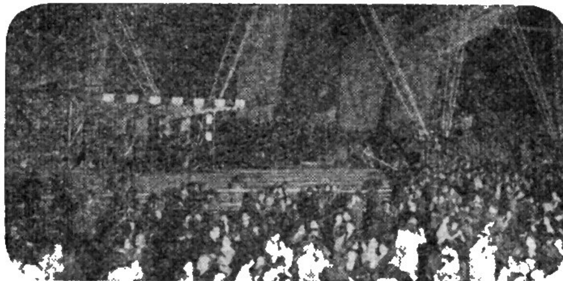
GALA NIGHT AT THE SOUTH BANK: 10.15

Gracie for TV. —Gracie Fields will appear in the television edition of "Music Hall" from the Theatre Royal, Leeds on October 13.